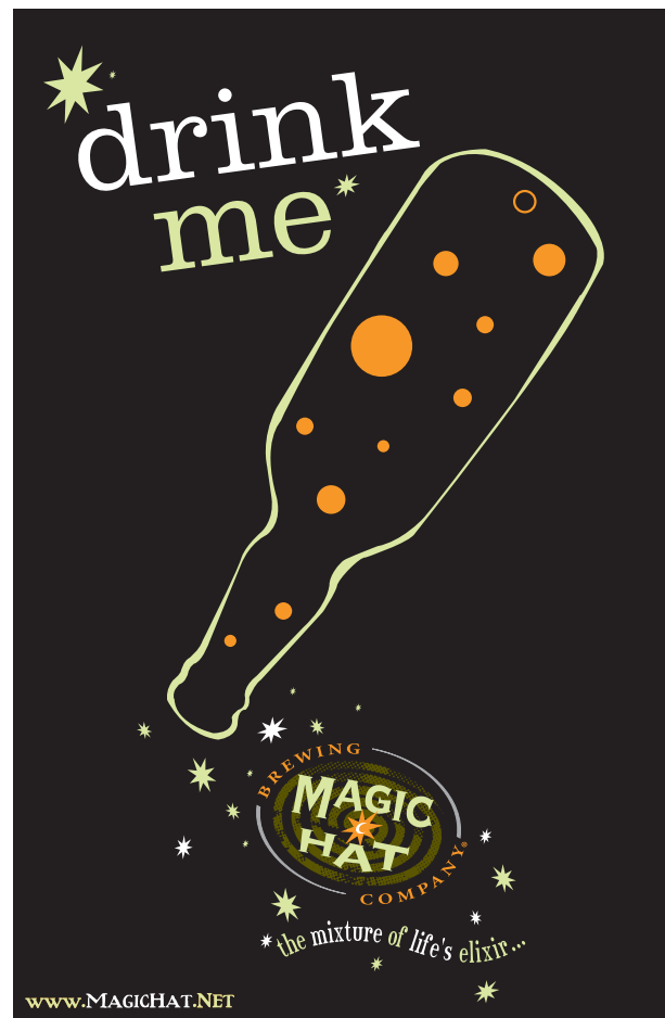
MAGIC HAT BREWING COMPANY

We've adapted an old technology to create vibrant new promotions. With FLASHERS displays, we can create picture perfect images that light up. We can then make the images sequence in any desired light up pattern. It is E.L. technology that lights up automobile dashboards, airplane cockpits and some watches.